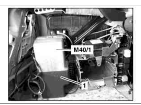
2 Electrical connector